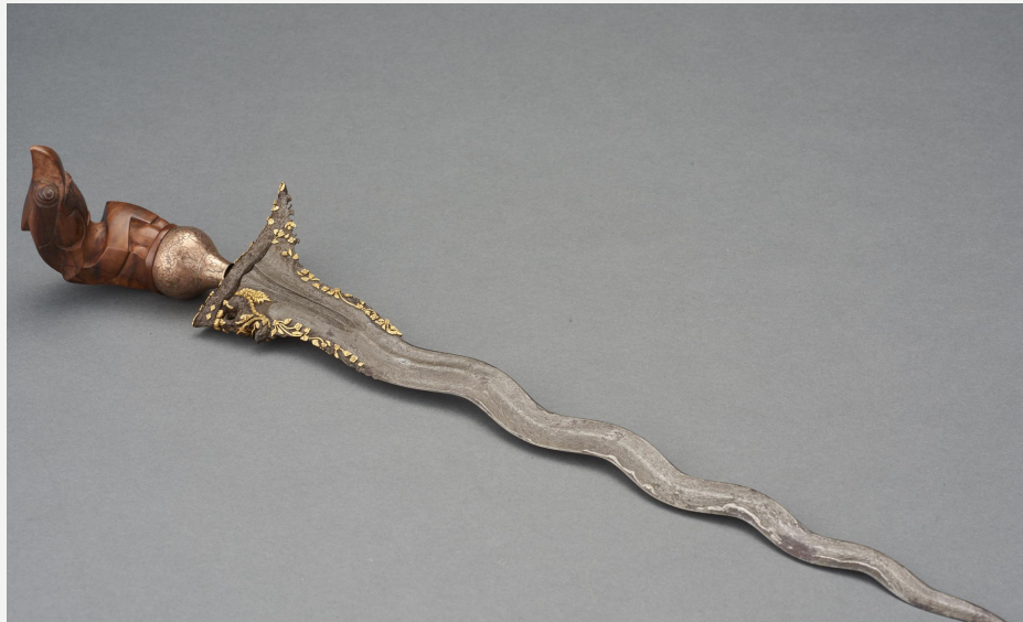
Keris Palembang 19 th Century, Palembang, Indonesia Collection of Asian Civilisation Museum, National Heritage Board